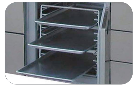
Removable Pan Slides