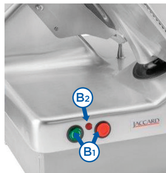
B1. IP67 Rating; Watertight; tamper resistant on/ off buttons.