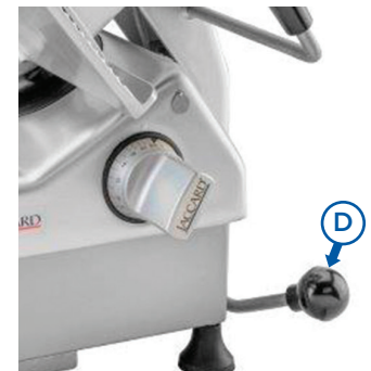
D. Lift leg for quick and easy cleaning under slicer.