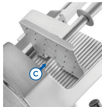
C. Large, low profile carriage for easy loading.